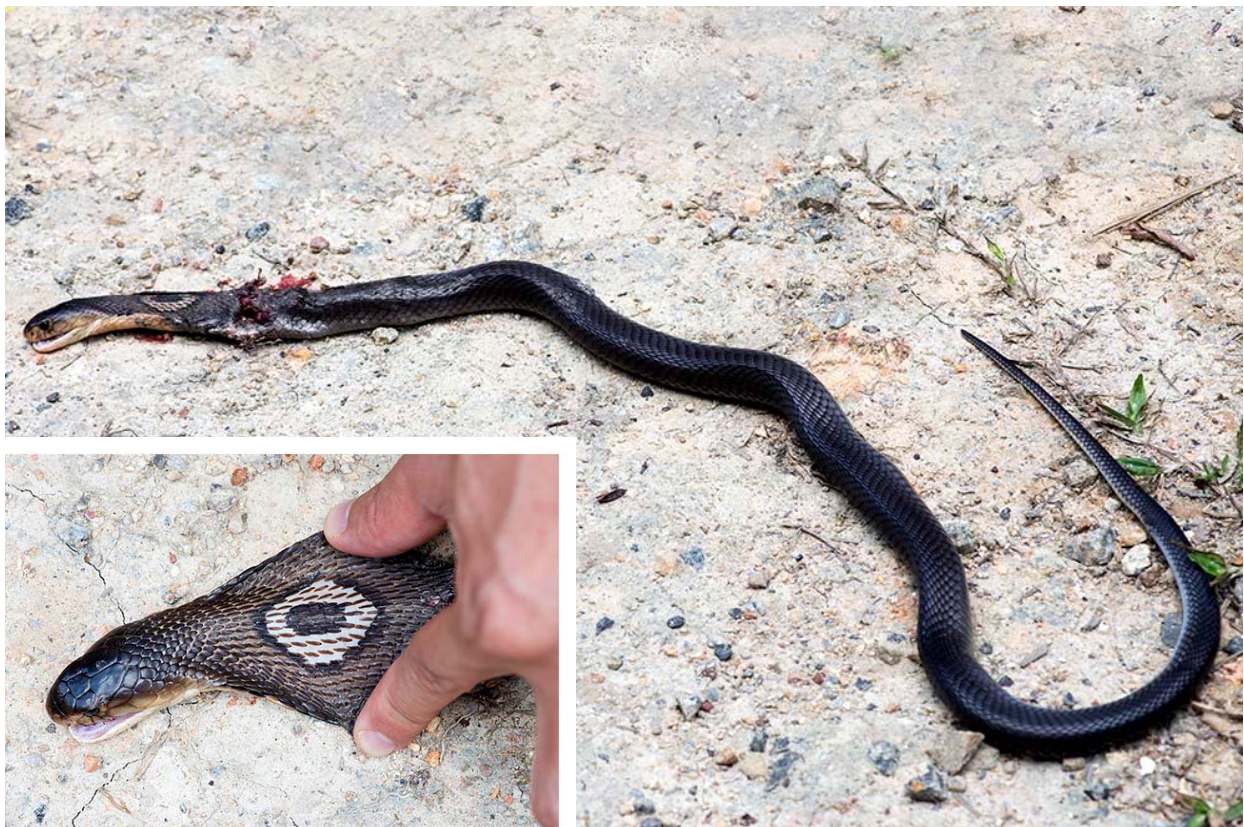
Fig. 1 and inset.

Description of record: A fresh roadkill, with an estimated total length of 100 cm, was found whilst driving along the road from The Gap to Kuala Kubu Baru. The body immediately posterior to the hood appeared to have been crushed by a vehicle. The specimen was moved to the side of the road, photographed (Fig. 1) and then placed in the forest nearby.