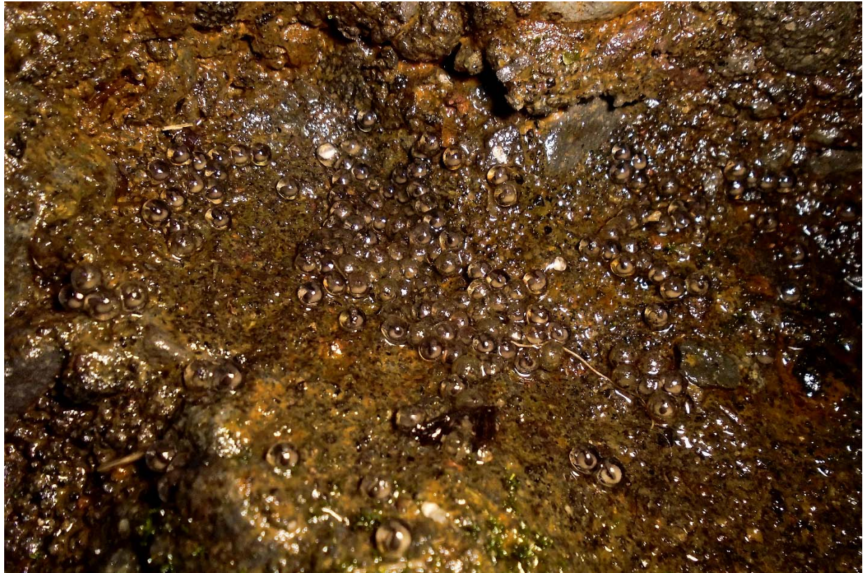
Fig. 2. Close-up of Limnonectes woodworthi nest and eggs.