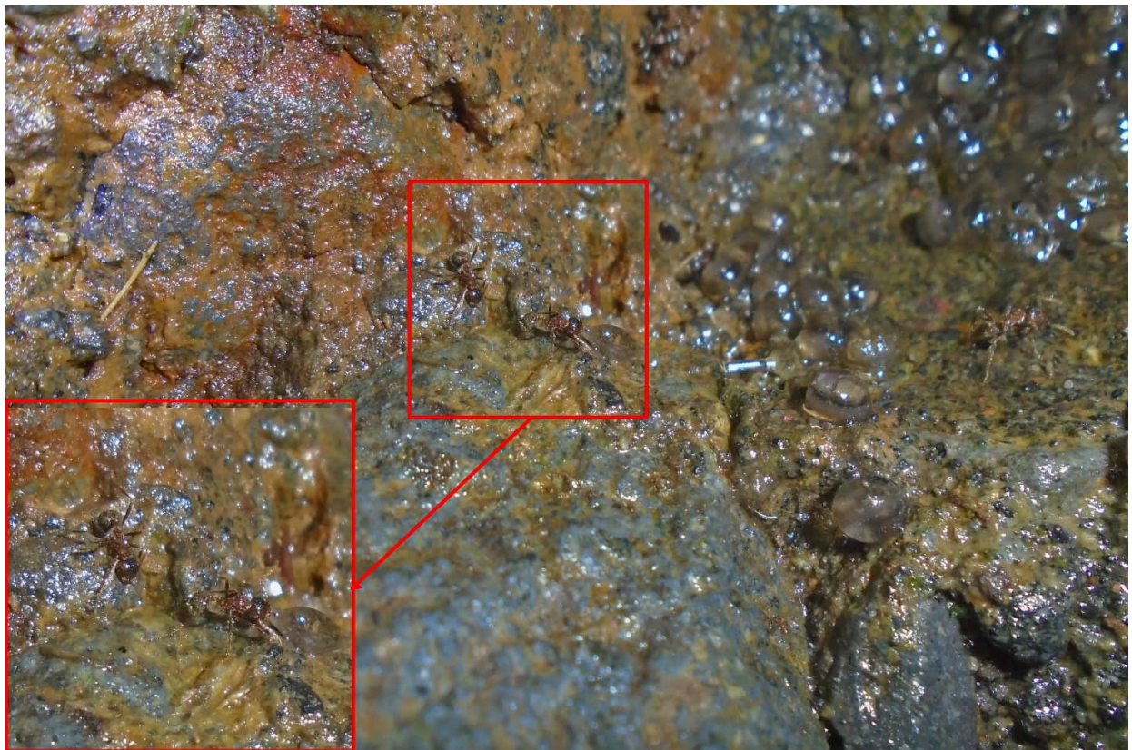
Fig. 4. Predation of ants on Limnonectes woodworthi eggs.