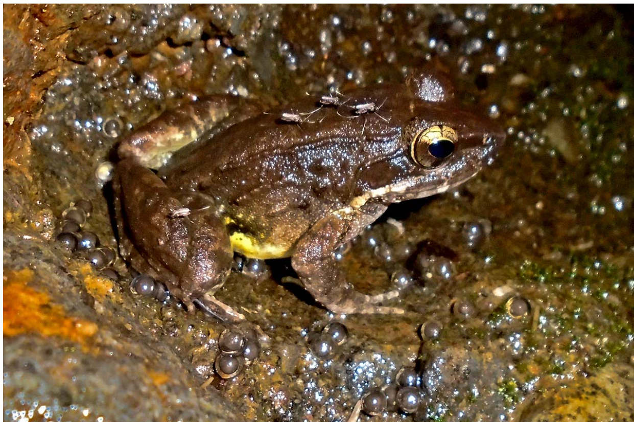
Fig. 1. Adult male Limnonectes woodworthi perched on nest.

Description of record: On the evening of 11 June 2017, an adult vocalizing male Limnonectes woodworthi was observed along with a clutch of eggs, on a moist narrow rock platform, approximately 1 metre above a small and shallow pool of water (Figs. 1 to 3). The area is along a relatively dry stream bed (Fig. 3), which seems to only have flowing water when there has been continuous heavy rains for several days. The eggs were observed to be around Stage 11 to 12 based on Gosner (1960). On the morning of 18 June 2017, the nest site was revisited and it was in the process of being actively predated by ants (Figs 4 & 5).