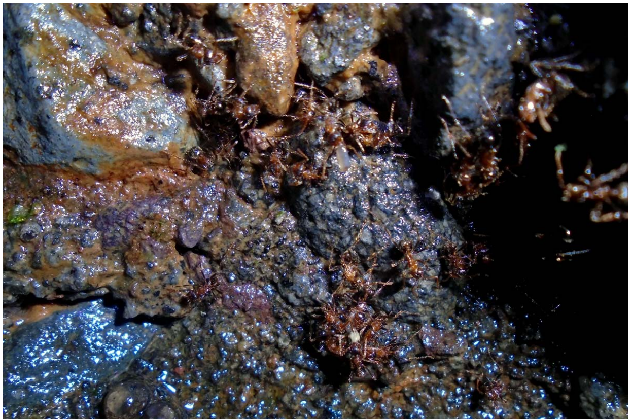
Fig. 5. Close-up of predation of ants on Limnonectes woodworthi eggs.